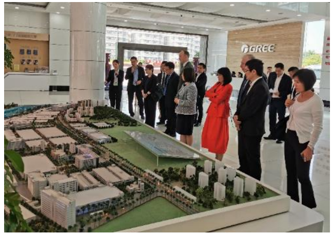
Melco senior executives visited Gree Electric Appliances' headquarters in Zhuhai.